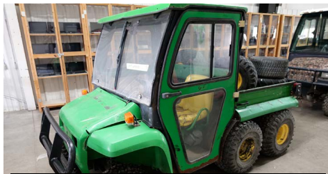
John Deere Gator 6 x 4, needs work