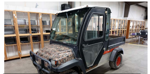
Bobcat model 2200 4 x 4, needs battery, maybe more